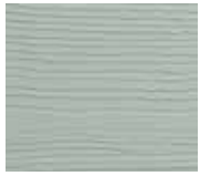
Cape Cod Gray